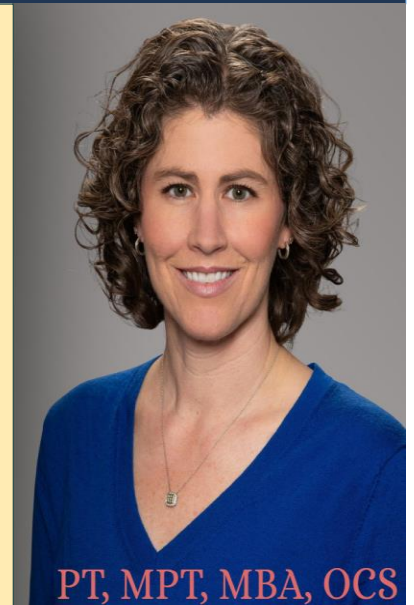
PT, MPT, MBA, OCS

A long bike ride in the morning, a great lunch, and an afternoon at Lake Tahoe, or even by a pool.